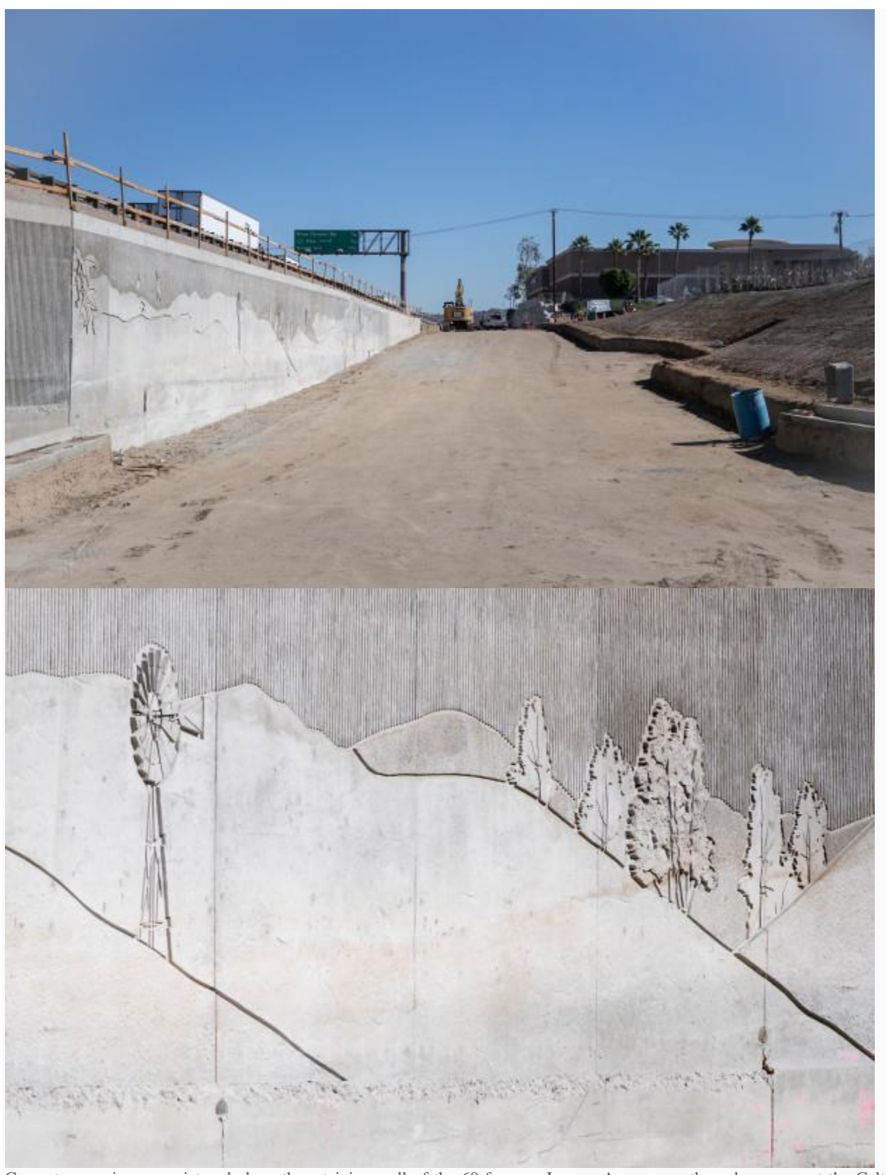
Cement engravings are pictured along the retaining wall of the 60 freeway Lemon Avenue westbound on ramp at the Caltrans construction site in Diamond Bar on Wednesday, February 7, 2018.