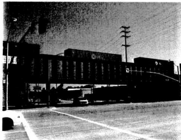
Opened Sunset Ave Intersection at Valley Blvd.