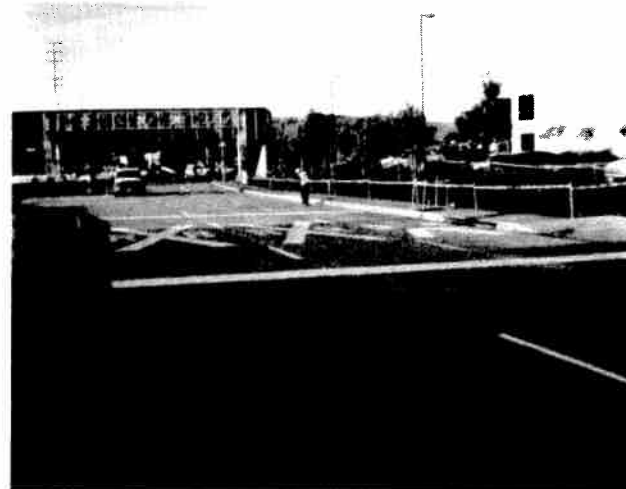
Finished PCC Roadway, Stamped Concrete Median & Striping